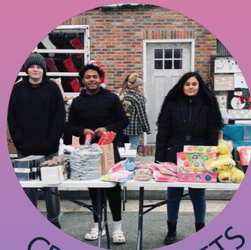
CRAFTS & GIFTS

VISIT WWW.POPUPMARKETAC.COM FOR VENDOR INQUIRIES.